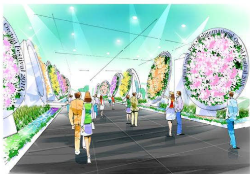
Image of Orchid Avenue in 2010

"Orchid Avenue" is from the entrance of the venue to the Symbol Podium, where twenty large year's plates decorated with orchids are exhibited. Each plate diameter is 2.5 meters in diameter.