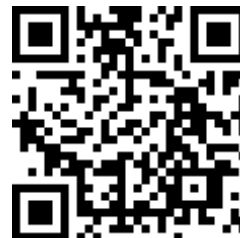
QR code for mobile site