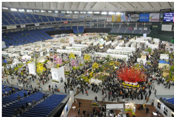
Overview in the site at JGP 2009