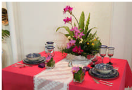
Dish Display in 2009

The Dish Display is an invitation to enjoy orchids in the home with orchids displayed with a table setting. Since 2004, the exhibits have been produced with the co-operation of embassies. The participating countries in 2010: Canada, France, Madagascar, the Republic of Colombia and the Republic of Indonesia.