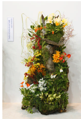
Award for Excellence in Division. III Display and in Division VI Miniature Orchid Garden in 2009