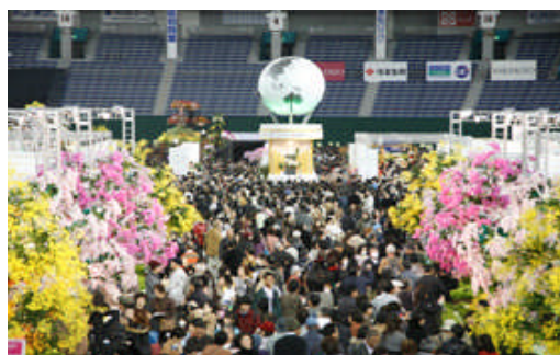
Orchid Avenue in 2009

Orchid Square is a place for communication. Here visitors can look, touch, learn and enjoy orchids. We suggest also how to enjoy orchids in the house, or how to grow orchids and other topics of interest. Orchid culture lessons are held for visitors where they can learn from orchid experts how to grow orchids.