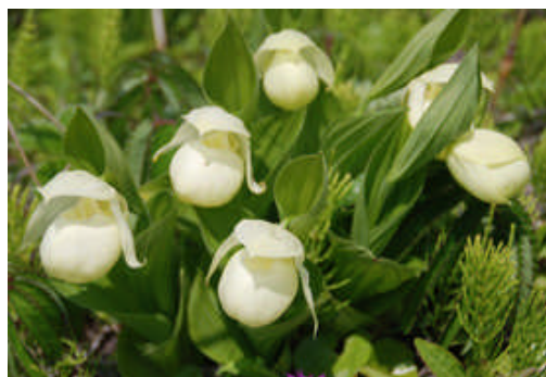
Cypripedium marcanthum var. rebunense